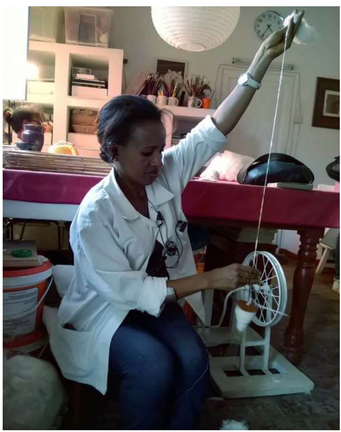
The skein winder

changes, depending on the periods; there have been even 28 workers in the workshop. With their deft hands, the spinners pull a thin thread out of the soft cotton mass and roll it up on a reel; then the thread is wound in a hank by a skein winder.