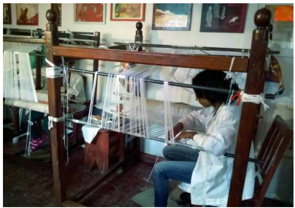
The weaving loom