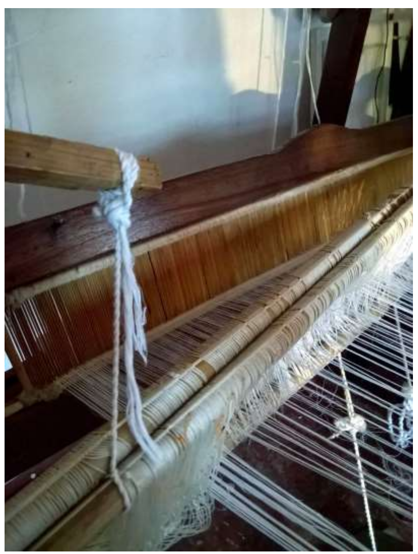
The weaving loom